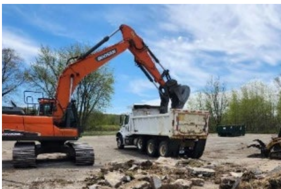
Demolition of parking lot in progress.

GAOA LRF is funding Maintenance Action Teams (MATs) in the National Park Service and U.S. Fish and Wildlife Service. MATs are teams of federal employees, and in some cases NPS interns and members of youth and service corps, who can quickly mobilize across their region to complete smaller scope repair, rehabilitation, or historic preservation activities.