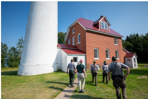
Outer Island at Apostle Islands National Lakeshore.

Apostle Islands National Lakeshore is a remote archipelago in Lake Superior known for its unique geology, the largest concentration of lighthouses in the country, and its historic and archeological resources. The Outer Island Dock, the main access point to Outer Island, was constructed in 1958 and has structural integrity concerns and is beyond its lifespan. This project will rehabilitate the dock to address deficiencies with dock stabilization and the base materials. Project work will also improve the tram connection that facilitates safe transportation of materials and supplies from the dock to light station and replace the stone protection along the dock's perimeter. These improvements will help ensure the dock can support emergency response, visitor access, light station maintenance, and park operations for many years to come.