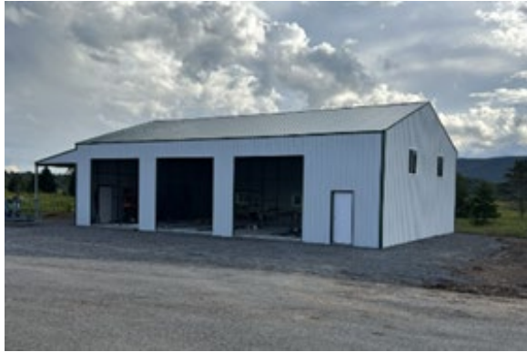
Completed Schaeffer Building.

Canaan Valley National Wildlife Refuge is a high-elevation wetland habitat for many threatened and endangered species and provides visitor access to hunting, fishing, cross-country skiing, hiking, and boating. This project is renovating the interior and exterior of the Schaeffer Building, which is used for equipment and maintenance supply storage. Work also includes replacing the roof and siding and improving vehicular and pedestrian access around the structure.