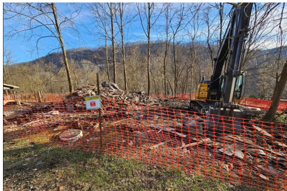
Adkins House during demolition.

New River Gorge National Park and Preserve