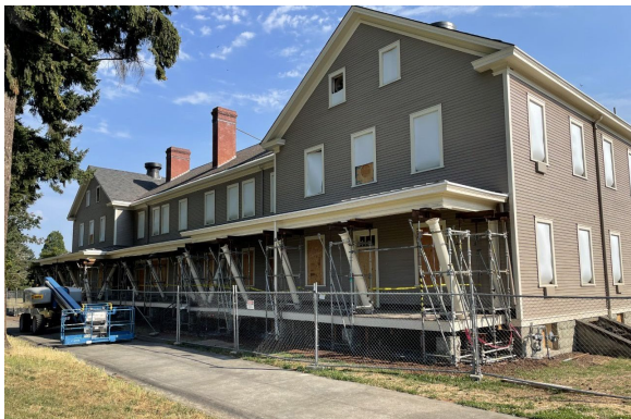
Repairs to Barracks Building.

Fort Vancouver National Historic Site preserves the first U.S. Army post in the Pacific Northwest, which served as a major headquarters and supply depot during the Civil War and Indian War. The site holds a three-story barracks building that was built in 1907 and required rehabilitation. This project rehabilitated the historic barracks and associated campus parking areas to improve accessibility, address safety issues, and allow for continued public use and enjoyment while commemorating its historic significance.