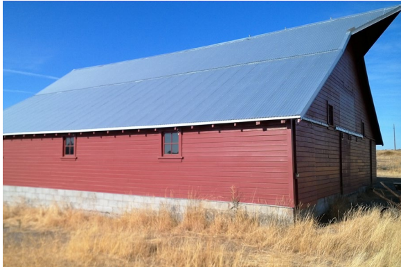
Repaired Folsom Farm Barn.

Washington's Spokane District is home to multiple historic buildings that offer visitors interpretive education opportunities and recreation activities like camping, hiking, and wildlife viewing. Several of these buildings had deteriorated due to harsh weather conditions. This project repaired and replaced the existing structural elements at four historic buildings, including the popular Folsom Farm Barn, to provide a safe environment for visitors and employees while maintaining the historical characteristics of each site.