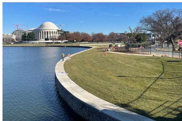
Completed repairs to the Tidal Basin seawall.

The iconic Tidal Basin reservoir in Washington, D.C. is famous for the breathtaking cherry blossoms that emerge each spring and nearby monuments including the Jefferson Memorial. Over 36 million people visit the Tidal Basin annually. However, the sidewalks had deteriorated and begun to sink, forcing some sections to close to the public because of flooding. This project rehabilitated the most critical portions of the seawalls and shoreline landscape around the Tidal Basin, including portions around the inlet bridge, a portion of the West Potomac Park seawall, and seawalls used as foundations for sidewalks, while using historic stone masonry where feasible. Improvements support long-term stability and resiliency of the Tidal Basin, better preparing the area for future sea-level rise and stronger storms.