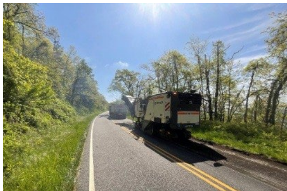
Repairs to Skyline Drive.

Skyline Drive is a National Historic Landmark that runs 105 miles along the crest of the Blue Ridge Mountains in Shenandoah National Park. The pavement on the road required repairs to prevent rapid deterioration and destabilization. This project rehabilitated a large segment of Skyline Drive pavement including 19 overlooks. This project provides visitors with safe travel experiences while driving or biking for years to come.