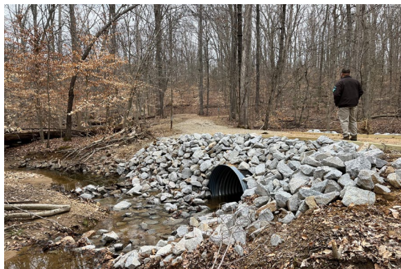
Completed culvert replacement.

The Meadowood Special Recreation Management Area offers opportunities for hiking, horseback riding, mountain biking, and enjoying wildlife in 800 acres of forest and meadows just outside of Washington, D.C. This project replaced deteriorated fencing, provided safe boundaries for the public, and protected resources. The project also replaced a deteriorating culvert and removed the former visitor center, which was a significant safety hazard. These repairs improved resource protection and provide safer experiences for visitors and employees.