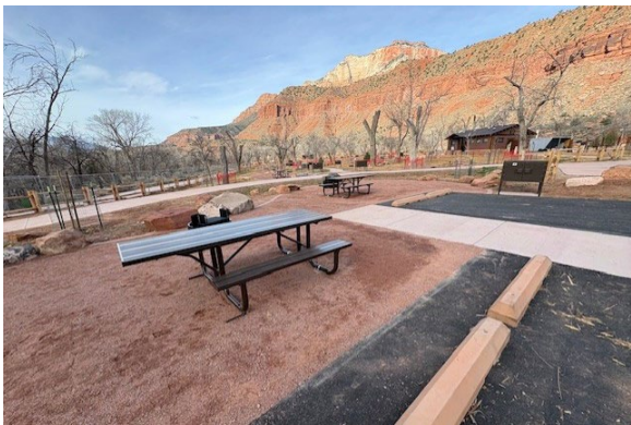
Repairs to campsite at Zion National Park in progress.

Zion National Park, Utah's first national park, spans a striking landscape of red sandstone cliffs, deep ravines, waterfalls, and hidden river valleys. This project is rehabilitating components within the aging campground that are in poor condition. Work includes rehabilitation of visitor facilities and amenities, a historic comfort station, campground roads, drainage systems, and approximately 128 campsites. This project is improving accessibility and safety improvements, to allow campers to enjoy this campsite for years to come.