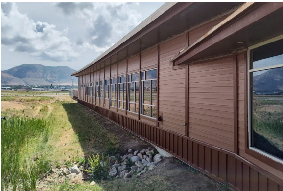
The Bear River Migratory Bird Refuge.

The Bear River Migratory Bird Refuge serves as feeding and breeding grounds for migratory birds in northern Utah, where the Bear River flows into the northeast arm of the Great Salt Lake. Flooding and aging infrastructure has created safety hazards and structural deficiencies at the refuge. This project is repairing the exterior siding, replacing the visitor center roof, and replacing the east and west boardwalks near the wildlife education center.