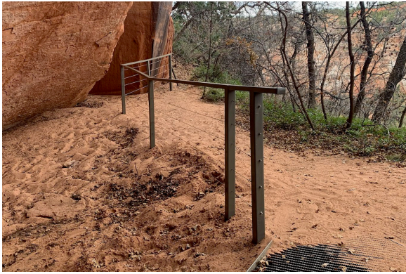
Newly installed safety fence at South Fork Indian Canyon Pictographs.

The BLM is responsible for various sites across the state of Utah that offer a wide range of outdoor recreation opportunities. This project repaired campsites at Three Peaks Large Group Campsite and Ponderosa Grove Campground, corrected drainage issues at Three Peaks Radio Control Model Port, and repaired a boardwalk and fencing at South Fork Indian Canyon Pictographs. The project enhances public experience, increases recreation access, and reduces annual maintenance costs across the sites.