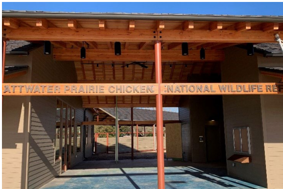
Completed administrative and visitor center at Attwater Prairie Chicken National Wildlife Refuge.

The Attwater Prairie Chicken National Wildlife Refuge spans 10,541 acres of habitat to protect one of the most endangered birds in North America—the Attwater’s Prairie-Chicken. This project replaced the aged and insufficient facilities and consolidated them into a new administrative and visitor facility and a multi-purpose maintenance building. It also replaced fences, allowing staff to distribute cattle across the refuge to prevent overgrazing, which supports improved habitat management for the Attwater’s Prairie-Chicken. These improvements enable the refuge to properly manage their grasslands and provide interpretive and environmental education for the public.