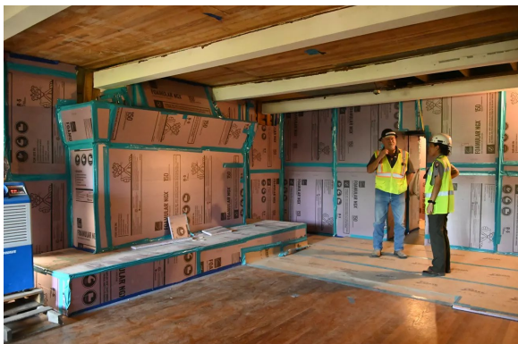
Texas White House interior under construction.

The Texas White House, where former U.S. President Lyndon B. Johnson spent a quarter of his presidency, is a fundamental park resource that hosted over 80,000 visitors annually before closing due to structural and environmental concerns in 2018. This project is addressing structural concerns, deferred maintenance, code compliance, and deteriorating historic features in the building. The project will help ensure the long-term integrity of the historic site and will allow it to reopen to the public.