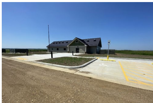
Completed headquarters building at Lake Andes National Wildlife Refuge.

Lake Andes National Wildlife Refuge is a critical wetland habitat for migratory birds and provides recreational opportunities for visitors including fishing, wildlife observation, and environmental education and interpretation. Due to flooding, some of the infrastructure at the refuge had been damaged beyond repair. This project is replacing the flood-damaged headquarters building; replacing trails, kiosks, a boat ramp, and observation deck; repairing damaged levees; and demolishing multiple excess buildings. These improvements will allow staff to administer environmental protection and public programming, increase access for employees and visitors, and support staff in carrying out the USFWS mission.