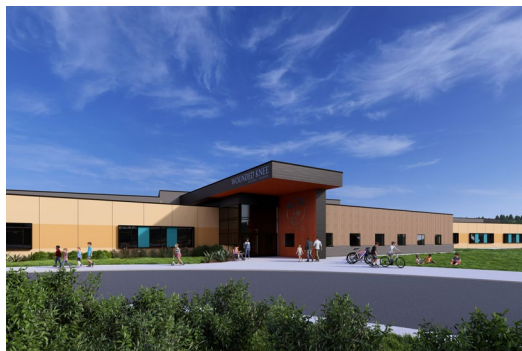
Design Rendering of the main entrance of the new Wounded Knee District School. Photo Credit: Co-op Architecture

Wounded Knee District School is an Oglala Lakota Sioux Nation school serving students from kindergarten through 8th grade. The campus was in poor condition and inadequate for current student and staff needs, which negatively impacted student learning capacity. This project is replacing the existing campus with new, energy-efficient academic facilities. When complete, this project will provide students with a safe and functional learning environment, which will help improve their ability to learn and grow.