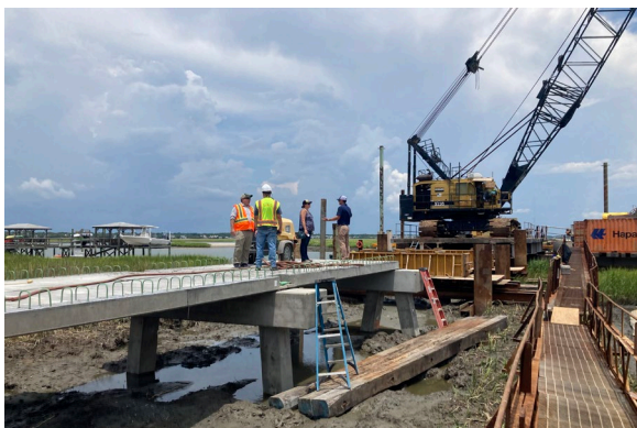
Repairs to the dock at Fort Moultrie in progress.

Fort Sumter and Fort Moultrie National Historical Park