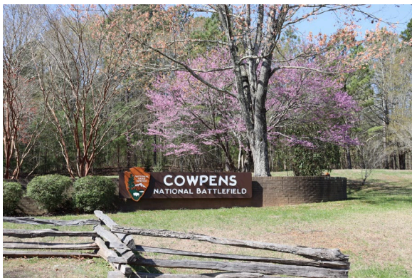
Entrance sign at Cowpens National Battlefield.

Congaree National Park, Cowpens National Battlefield, Kings Mountain National Military Park, Ninety Six National Historic Site