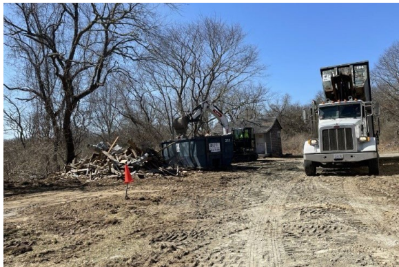
Demolition work at Trustom Pond National Wildlife Refuge.

GAOA LRF is funding Maintenance Action Teams (MATs) in the National Park Service and U.S. Fish and Wildlife Service. MATs are teams of federal employees, and in some cases NPS interns and members of youth and service corps, who can quickly mobilize across their region to complete smaller scope repair, rehabilitation, or historic preservation activities.