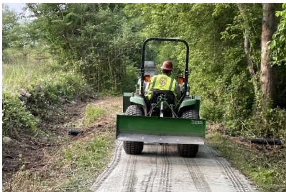
Trail resurfacing at Trustom Pond National Wildlife Refuge.

At Trustom Pond National Wildlife Refuge, MATs removed a deteriorating pole barn.