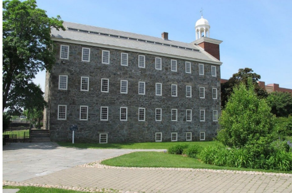
Wilkinson Mill.

Blackstone River Valley National Historical Park