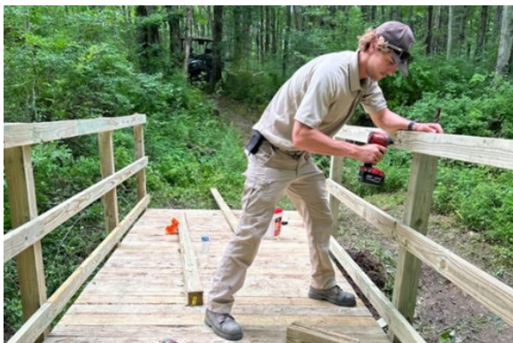
Trail bridge construction in progress at Erie National Wildlife Refuge.

GAOA LRF is funding Maintenance Action Teams (MATs) in the National Park Service and U.S. Fish and Wildlife Service. MATs are teams of federal employees, and in some cases NPS interns and members of youth and service corps, who can quickly mobilize across their region to complete smaller scope repair, rehabilitation, or historic preservation activities.