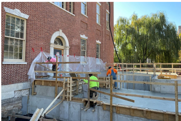
Repairs to the First Bank of the United States.