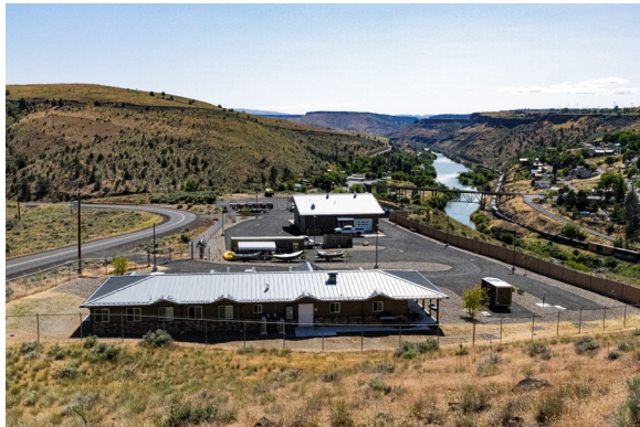
New Bakeoven Facilities in Maupin.

The BLM manages the Lower Deschutes Wild and Scenic River, which offers year-round river access for visitors to use the boat launches, day-use areas, and campgrounds. The staff and operations facilities that BLM utilizes to manage this area are based in Maupin. The existing buildings were outdated, not adequately sized or maintainable, and posed safety issues. This project demolished the deteriorating buildings at the site and replaced them a new office, workshop, and seasonal housing. These improvements help improve safety for staff, provide adequate storage space, and assist with multi-jurisdictional coordination among partners for emergency response and services including wildland fire and search and rescue efforts.