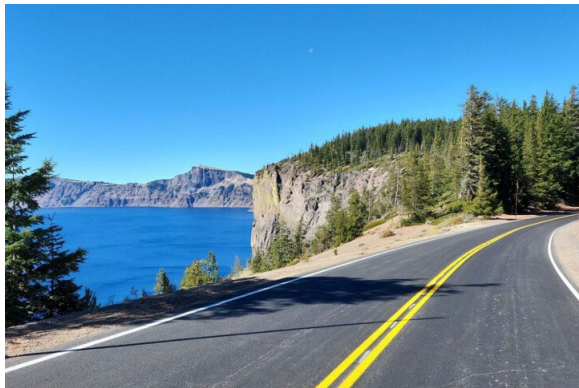
Completed road repairs to East Rim Drive.

Crater Lake National Park features one of the world's deepest and clearest lakes that was formed almost 8,000 years ago from a volcanic eruption. One of the park's historic roadways, East Rim Drive, has poor road conditions and features narrow, potholed, and rockfall-damaged pavement. This project is rehabilitating and applying modern safety standards to approximately 19 miles of the deteriorating road. The project is also repairing guard walls on several damaged historic rock walls, improving drainage structures, and rehabilitating parking areas. Repairs will help ensure safe travel for visitors and reduce park congestion.