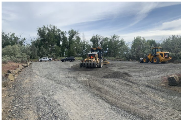
Cold Springs National Wildlife Refuge parking lot repairs in progress.

GAOA LRF is funding Maintenance Action Teams (MATs) in the National Park Service and U.S. Fish and Wildlife Service. MATs are teams of federal employees, and in some cases NPS interns and members of youth and service corps, who can quickly mobilize across their region to complete smaller scope repair, rehabilitation, or historic preservation activities.