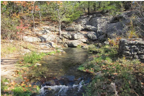
Antelope Springs at Chickasaw National Recreation Area.

Chickasaw National Recreation Area in Oklahoma contains springs, streams, and lakes and protects important historic structures built by the Civilian Conservation Corps in the 1930s. The existing water system and visitor amenities at the park are deteriorating. This project will repair or replace water and wastewater systems, improve and relocate electrical infrastructure, replace lift stations, and rehabilitate park comfort stations. The project also includes improvements to walkways, restrooms, parking, RV sites, trails, campsites, campsite features, and multiple park buildings. Completion of this project will improve utility operation, increase reliability, automation, and safety, and prevent disruptions to the availability of drinking water. It will also improve visitor experience and recreation opportunities.