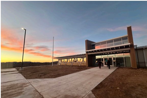
New administrative building at Wichita Mountains National Wildlife Refuge.