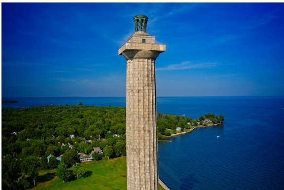
Aerial view of Perry's Victory & International Peace Memorial.

Perry's Victory and International Peace Memorial