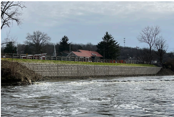
Completed riverbank stabilization near the Towpath Trail.

Cuyahoga Valley National Park in Ohio preserves and reclaims the landscapes around the once highly polluted Cuyahoga River and provides visitors with recreational opportunities for scenic excursions on the Cuyahoga Valley Scenic Railroad and Towpath Trail. Erosion along the Cuyahoga riverbank is impairing the park's most popular trail and causing the loss of riverside vegetation and riparian habitat. This project is stabilizing eight sites on the riverbank and repairs eroded riverbank areas to reduce vegetation and habitat loss, reduce the need for emergency maintenance or trail closures, and help provide a safe and enjoyable trail experience for visitors.