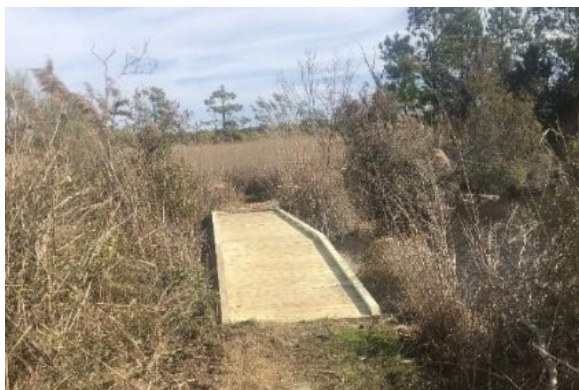
Repair work on the Great Marsh Loop Trail in progress.

GAOA LRF is funding Maintenance Action Teams (MATs) in the National Park Service and U.S. Fish and Wildlife Service. MATs are teams of federal employees, and in some cases NPS interns and members of youth and service corps, who can quickly mobilize across their region to complete smaller scope repair, rehabilitation, or historic preservation activities.