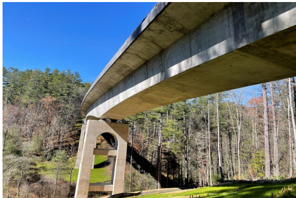
Under head view of the newly constructed Laurel Fork Bridge.

The Blue Ridge Parkway, spanning almost 500 miles across the crest of the Blue Ridge Mountains through North Carolina and Virginia, is one of the most visited NPS sites in the country with more than 16.7 million visitors in 2024. This project replaced the failing Laurel Fork Bridge in Ashe County, NC, originally built in 1939. The old bridge was near the end of its lifespan and was often closed during major wind events due to safety concerns. The replacement bridge provides safe, accessible, and continuous visitor access.