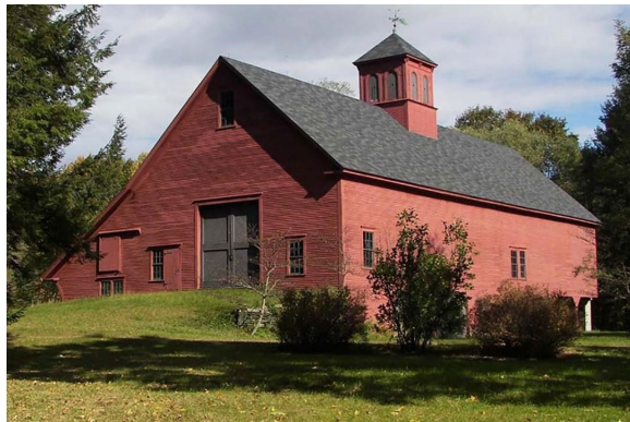
Blow-Me-Down Farm at Saint-Gaudens National Historical Park.

Saint-Gaudens National Historical Park features the home, studios, and gardens of Augustus Saint-Gaudens, one of America's greatest sculptors. Historic buildings at the site have deteriorated and critical building systems require replacement to protect high value art collection from fire, theft, and damage. This project will replace mission-critical fire and security systems, update electrical infrastructure, replace the HVAC system, and modify facilities to meet accessibility standards. Work also includes rehabilitating historic structures to serve as a center for the arts and support future leasing opportunities. The buildings will be more reliable, resilient, and energy efficient, providing safe and comfortable facilities for staff and visitors.