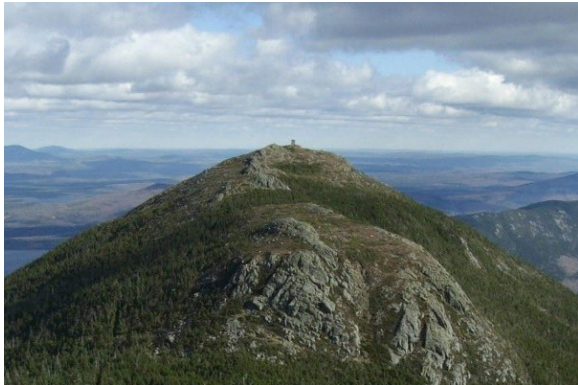
The Appalachian National Scenic Trail.