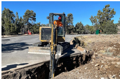
Rehabilitation of deteriorated wastewater collection and water distribution systems in progress.

The Great Basin National Park offers diverse recreational experiences such as climbing to the 13,000-foot summit of Wheeler Peak, exploring limestone formations in Lehman Caves, and stargazing in the International Dark Sky Park. This project replaced and rehabilitated the deteriorating water distribution and wastewater collection systems which provide critical infrastructure for visitors, staff, housing, fire suppression, and law enforcement.