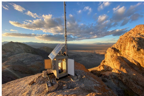
Radio infrastructure on Sawtooth Mountain after improvements.

The Bureau of Land Management administers various communications sites in Nevada that aid in supporting fire suppression, rescue operations, and employee safety. This project is removing safety hazards at numerous communications sites, resulting in improved reliability in the state’s communication system. Improvements include replacing tower safety equipment, replacing cable safety equipment, and restoring grounding systems, resulting in compliance with current safety and operational standards.