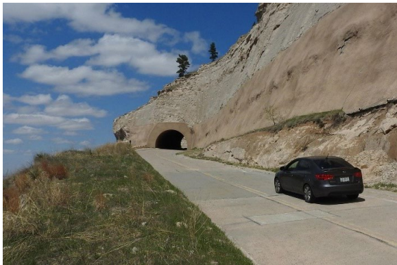
Summit Road at Scotts Bluff National Monument.

Built in the 1930s, the Summit Road is the oldest concrete road in the state of Nebraska and gives visitors a chance to reach the top of Scotts Bluff by car. This project will rehabilitate sections of the Summit Road and parking areas, which are deteriorating. Work includes replacing deteriorated sections, removing and replacing old expansion joint caulking, and repairing the retaining wall to match the existing structure. The project will also relocate the gate at the visitor center to provide enhanced security from oversized vehicles entering the tunnels and causing damage. Road repairs will improve visitor experience and provide continued access to the bluff vista and visitor center.