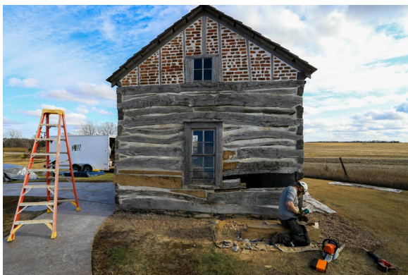
MAT member restoring the historic Palmer-Epard Cabin.

GAOA LRF is funding Maintenance Action Teams (MATs) in the National Park Service and U.S. Fish and Wildlife Service. MATs are teams of federal employees, and in some cases NPS interns and members of youth and service corps, who can quickly mobilize across their region to complete smaller scope repair, rehabilitation, or historic preservation activities.