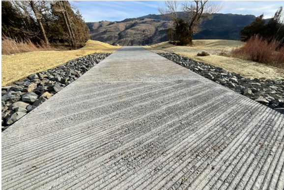
New, completed Carbella Boat Launch at Cabella Recreation Site.

Carbella Boat Ramp, a primary takeout for whitewater rafting on the Yellowstone River just north of Yellowstone National Park, has been significantly upgraded to better serve the high volume of users it receives. The outdated concrete plank launch has been replaced with a longer, monolithic concrete boat ramp, providing a more durable, grooved surface designed for improved traction. This enhanced design greatly increases accessibility, safety, and efficiency, making it easier for recreationists to launch and retrieve boats. Overall, the new ramp is a substantial improvement and offers a far better experience for all river users.