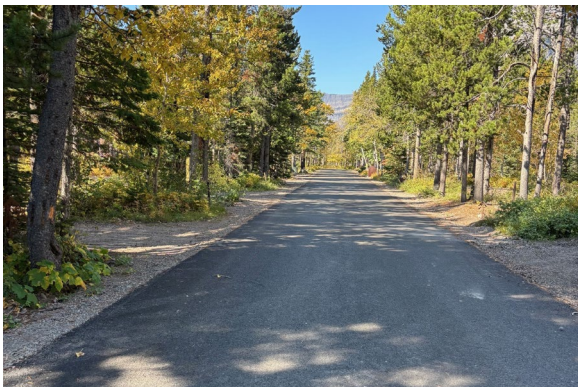
Fresh road paving completed as part of the Swiftcurrent water distribution system replacement.

Glacier National Park in Montana features glaciers, alpine meadows, carved valleys, and spectacular lakes with over 700 miles of trails, historic chalets and lodges, and the famous Going-to-the-Sun Road. This project replaced the 50-year-old water distribution system at Swiftcurrent, including rehabilitation and replacement of key system equipment for improved operational efficiency, reliability, and monitoring. This project helped improve the safety of drinking water, ensuring a reliable and adequate water supply, and enabling fire protection support.