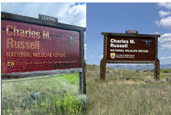
Old and new refuge signs.

GAOA LRF is funding Maintenance Action Teams (MATs) in the National Park Service and U.S. Fish and Wildlife Service. MATs are teams of federal employees, and in some cases NPS interns and members of youth and service corps, who can quickly mobilize across their region to complete smaller scope repair, rehabilitation, or historic preservation activities.