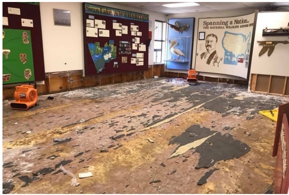
Interior damage cleanup in progress at Swan Lake National Wildlife Refuge.

Swan Lake National Wildlife Refuge is designated as an Important Bird Area for Missouri and provides habitat, sanctuary, and breeding grounds for migratory birds and other wildlife. The headquarters office building at the refuge was constructed in 1981 and has been uninhabitable since 2019 due to flood damage. This project will demolish the old office building and replace it with a new office building to provide a safe and accessible space for both staff and the public. The new building will improve energy efficiency, lower operating costs, and be relocated to prevent future flooding issues. This project will also make necessary repairs to equipment storage buildings, levees, and roads.