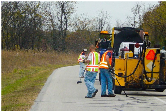
Road repairs at Ozark National Scenic Riverways.

From scenic riverways to historical sites, the national parks in Missouri are plentiful and offer visitors the chance to immerse themselves in the state's history, natural beauty, and culture. However, roads and parking areas have deteriorated with the potential to cause safety hazards and damage to vehicles. This project is repairing roads and parking lots by applying a variety of asphalt treatments at George Washington Carver National Monument, Ozark National Scenic Riverways, and Wilson's Creek National Battlefield. This project improves and extends the life of the paved areas to increase safety and experience when driving through these parks.