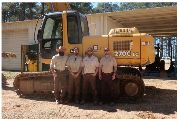
MAT crew at Sam D. Hamilton National Wildlife Refuge.

GAOA LRF is funding Maintenance Action Teams (MATs) in the National Park Service and U.S. Fish and Wildlife Service. MATs are teams of federal employees, and in some cases NPS interns and members of youth and service corps, who can quickly mobilize across their region to complete smaller scope repair, rehabilitation, or historic preservation activities.