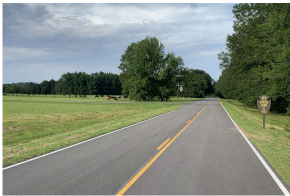
Freshly paved section of the Natchez Trace Parkway.

The Natchez Trace Parkway is a scenic roadway along the “Old Natchez Trace” historic travel corridor that offers present day visitors the opportunity for hiking, bicycling, camping, horseback riding, and fishing. The existing roadway was deteriorating, presenting safety and accessibility issues to drivers. This project is repairing up to 50 miles of the parkway across both its phases, including public access routes, parking lots, deteriorated pavements, bridges, culverts, audible pavement markings, and safety edges. The project will improve accessibility and provide a smoother and safer road for motorists and bicyclists.