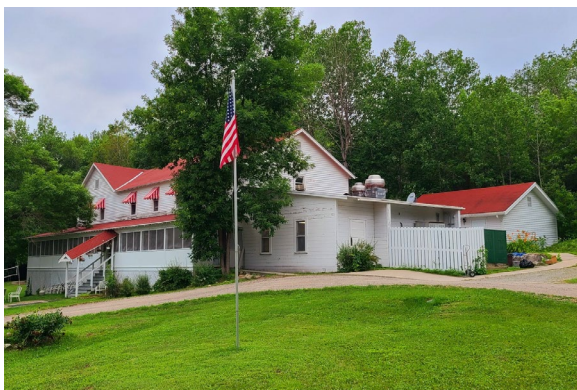
Kettle Falls Hotel at Voyageurs National Park.

With over 200,000 acres, Voyageurs National Park in Minnesota is full of exposed rock ridges, cliffs, wetlands, forests, and lakes that offer year-round recreation opportunities. The historic Kettle Falls Hotel offers the only lodging at the parks and is only accessible by water. The electrical system that services the remote, historic hotel and surrounding areas was beyond its service life and frequently failed, resulting in lengthy power outages. This project is replacing the main underwater high voltage cable and multiple transformer boxes running from the mainland to the Kettle Falls district, replacing other components as needed, and installing additional emergency backup generation. Project work is providing electricity for the site with increased safety, efficiency, and reliability for guests and visitors.