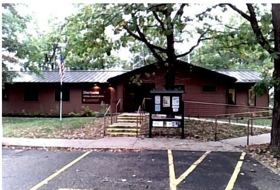
Sherburne National Wildlife Refuge visitor center before renovations.

Sherburne National Wildlife Refuge is an urban refuge located in one of the fastest growing counties in Minnesota that offers more than 30,000 acres of prairie land, forest, wetland, and riverine habitats for visitors to explore. The refuge currently houses visitor services at a deteriorating facility that is not meeting current visitor needs because it is inaccessible, lacks drinking water, has pest infestations, and can only hold small groups due to the inadequate septic systems. This project will construct a new visitor center and office building and complete repairs to other refuge infrastructure including levees, water control structures, and storage buildings. The new visitor center will be more energy efficient, reduce operations and maintenance costs, and improve visitor service programming.