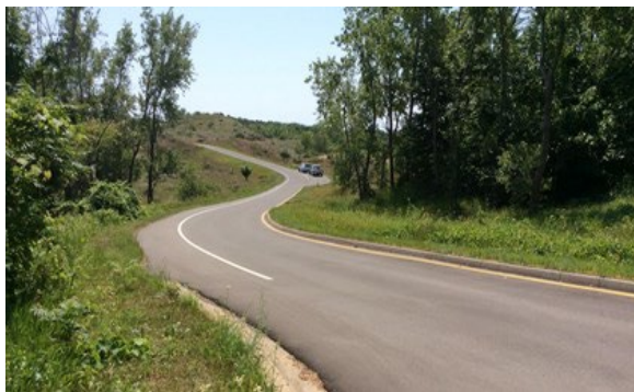
Paved road at Sleeping Bear Dunes National Lakeshore.

Pictured Rocks National Lakeshore and Sleeping Bear Dunes National Lakeshore offer a beautiful four-season landscape of sandstone cliffs, beaches, and waterfalls for visitors to explore. The parks' main roads and parking units had deteriorated and posed a safety hazard to park and visitor vehicles. This project applied a variety of asphalt treatments to the paved areas, including crack sealing, chip sealing, and patching to extend the life of paved surfaces, decrease park maintenance activities, and eliminate safety hazards.