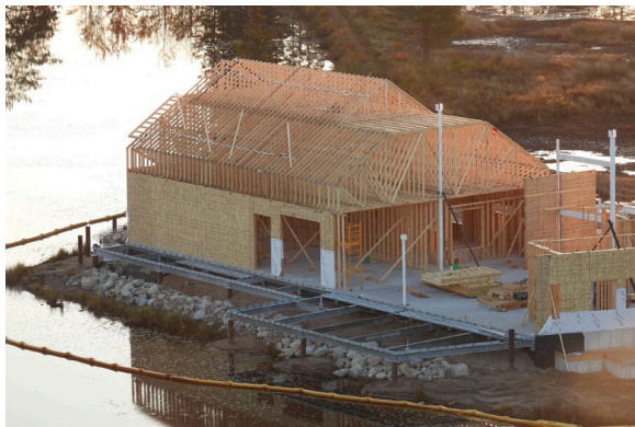
Aerial view of repairs at Seney National Wildlife Refuge.

Seney National Wildlife Refuge spans over 95,000 acres of refuge, breeding ground, and sanctuary for migratory birds, fish, and plant habitat. The visitor center and office buildings at the refuge had aged beyond their useful life and no longer adequately support visitation. This project is replacing the buildings with one collocated, energy efficient facility to provide an improved visitor experience. The project is also replacing parking areas, resurfacing the entrance road, and rehabilitating the Pine Ridge Nature Trail.