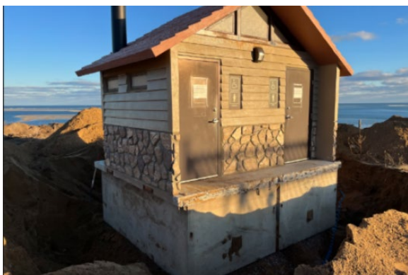
The vault toilet facility before its relocation.

GAOA LRF is funding Maintenance Action Teams (MATs) in the National Park Service and U.S. Fish and Wildlife Service. MATs are teams of federal employees, and in some cases NPS interns and members of youth and service corps, who can quickly mobilize across their region to complete smaller scope repair, rehabilitation, or historic preservation activities.