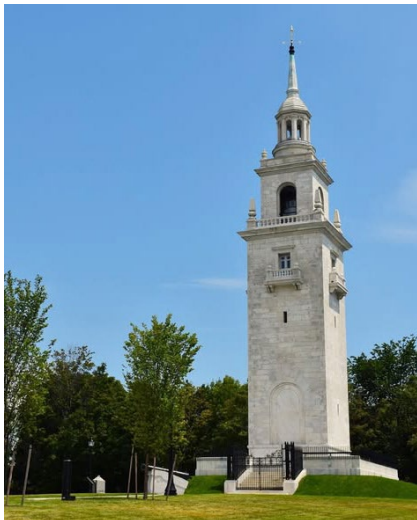
Dorchester Heights Monument after restoration.

Dorchester Heights Monument at Boston National Historical Park preserves the 115-foot commemorative marble tower at the site of Revolutionary War fortifications that led to British troops evacuating Boston. However, conditions at the tower required urgent attention due to deterioration of structural elements, water damage, and damaged sidewalks that resulted in closure of areas for safety. This project completed repairs and restoration of the commemorative tower and surrounding area, including structural and foundational restoration, plumbing improvements, and accessibility improvements. This project helps ensure that the site can support commemorative activities associated with the 250th anniversary of signing of the Declaration of Independence in 2026.