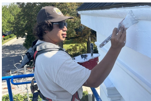
Exterior painting of Rockland Visitor Center.

GAOA LRF is funding Maintenance Action Teams (MATs) in the National Park Service and U.S. Fish and Wildlife Service. MATs are teams of federal employees, and in some cases NPS interns and members of youth and service corps, who can quickly mobilize across their region to complete smaller scope repair, rehabilitation, or historic preservation activities.