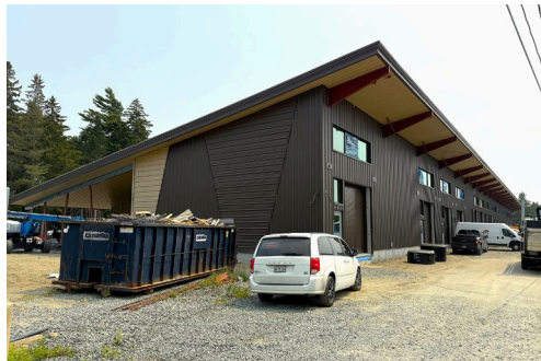
Exterior of the new maintenance facility at McFarland Hill Headquarters.