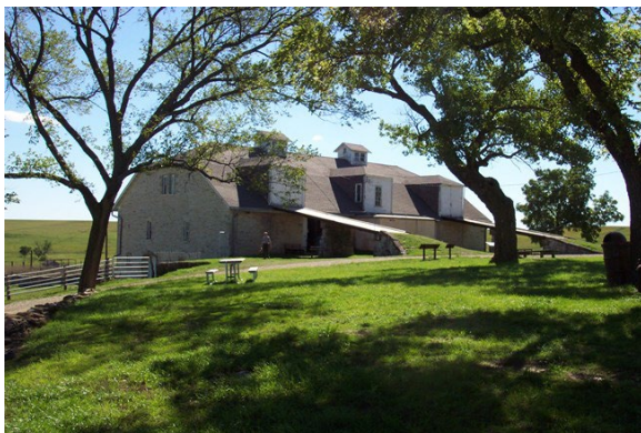
The 1882 historic Spring Hill limestone barn.

Tallgrass Prairie National Preserve protects a nationally significant remnant of the once vast tallgrass prairie ecosystem, while preserving a unique collection of cultural resources from prehistoric times through the ranching era. The Lantry Area historic buildings and Spring Hill Ranch Barn have not been rehabilitated since the park was established in 1996 and have deteriorated due to the elements and age. This project will rehabilitate these buildings including repairing foundations, walls, wooden support structures, beams, doors, windows, dormers, and cupolas. Additionally, project work will replace roofs and create an accessible path from the parking area to the Spring Hill Ranch Barn. This project will protect and improve the historic site and provide a safe and enjoyable experience for visitors and staff.