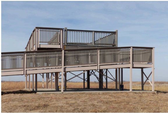
Little Salt Marsh boardwalk at Quivira National Wildlife Refuge.

The Great Plains Nature Center (GPNC) is an education center in Wichita promoting environmental stewardship and providing opportunities for the public to appreciate wildlife. The GPNC building has foundation issues and aging lighting and audio systems that impact public safety, limit educational programs, and make operations inefficient. This project will rehabilitate and repair the entire building, so it is able to support the group's mission. Quivira National Wildlife Refuge (NWR) is a Wetland of Global Importance and provides and protects vital habitat for migratory waterfowl. This project will also address aging infrastructure at Quivira NWR, making repairs to access roads, levees, trails, bridges, water control structures, and replacing or rehabilitating staff housing.