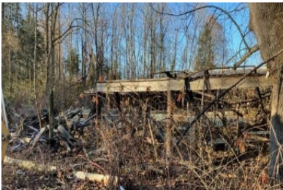
Demolition to storage building in progress.

GAOA LRF is funding Maintenance Action Teams (MATs) in the National Park Service and U.S. Fish and Wildlife Service. MATs are teams of federal employees, and in some cases NPS interns and members of youth and service corps, who can quickly mobilize across their region to complete smaller scope repair, rehabilitation, or historic preservation activities.