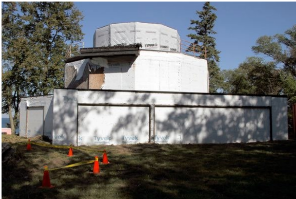
Renovations to the House of Tomorrow in progress.

Indiana Dunes National Park, home to shifting sand dunes and significant plant and bird diversity along the coast of Lake Michigan, offers recreation such as beachgoing, swimming, fishing, horseback riding, hiking, and cross-country skiing. Many of the historic facilities at the park have been closed to the public for several years due to structural instability and unsafe conditions. This project is completing historic rehabilitation on the popular and significant historical structures at the Bailly Homestead, Good Fellow Camp, and the House of Tomorrow. These repairs will enable educational programming and eventually reopen structures to the public. The project is also improving water and wastewater systems, moving power lines underground, and incorporating modernized technology to increase energy efficiency.