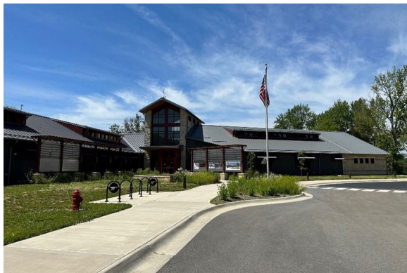
Newly constructed Crab Orchard Visitor Center.

Crab Orchard National Wildlife Refuge spans 44,000 acres of diverse habitats and offers recreation including hiking, canoeing, hunting, camping, picnicking, photography, and birdwatching. The refuge had leaking water and sewer lines, a visitor center that was beyond its useful lifecycle, and outdated campground facilities. This project is repairing or replacing waterlines and sewer lines, has replaced the visitor center with a modern facility, and is modernizing campground facilities and related outdoor recreation facilities including shower buildings, water lines, campgrounds, and campground roads. This will make the refuge safer and more attractive to visitors, while saving the facility thousands of dollars in lost revenue from leaks.