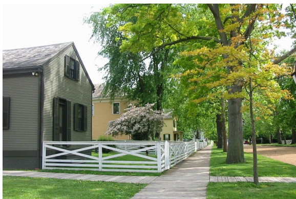
Wooden boardwalk sidewalk outside the Arnold House.

Lincoln Home National Historic Site, located in Springfield, IL, preserves and protects the only home ever owned by President Abraham Lincoln and its surrounding neighborhood. The existing pavement surfaces, which are comprised of brick, wooden boardwalk, and asphalt, have deteriorated and are prone to frequent shifting and buckling. This project will replace deteriorating pavement along streets, parking areas, and walkway surfaces in order to provide accessible pedestrian routes. Following completion of this work, wheelchairs and other mobility assistance devices will be able to traverse smooth, firm, and properly graded pavement surfaces. This project will provide for a more enjoyable and safe pedestrian experience for all visitors and staff.