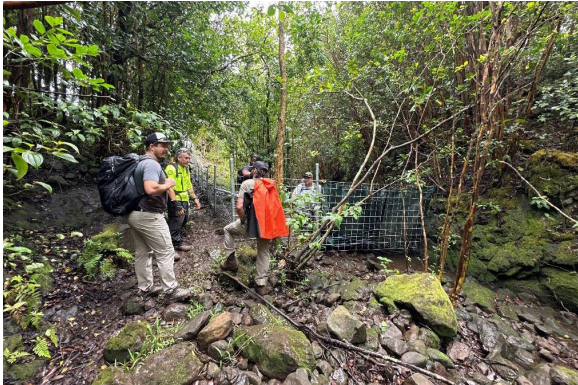
Fence rehabilitation work at Hawai'i Volcanoes National Park.

Haleakalā National Park, Hawai'i Volcanoes National Park, Kalaupapa National Historical Park