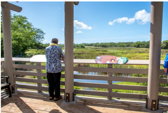
Betty Bliss Overlook at Pearl Harbor National Wildlife Refuge.

GAOA LRF is funding Maintenance Action Teams (MATs) in the National Park Service and U.S. Fish and Wildlife Service. MATs are teams of federal employees, and in some cases NPS interns and members of youth and service corps, who can quickly mobilize across their region to complete smaller scope repair, rehabilitation, or historic preservation activities.