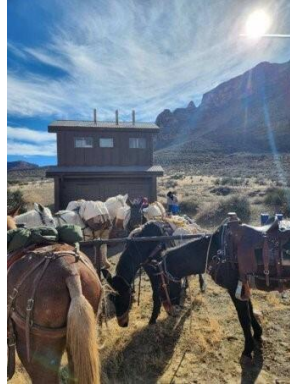
Hauling Waste and Supplies

This project provided daily service to all toilets used by backcountry hikers. This work included removing waste materials, stocking supplies, and servicing composting toilets in locations where access is limited to foot, mule, boat, or helicopter. Over 340,000 park visitors access the backcountry annually.