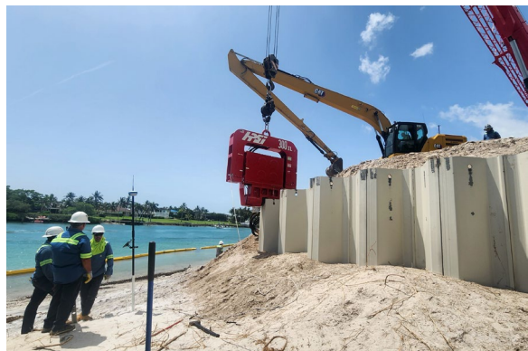
Repairs to the shoreline in progress at Jupiter Inlet Lighthouse Outstanding Natural Area.