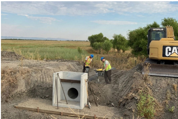
Workers replacing water management infrastructure.

San Luis National Wildlife Refuge is a major wintering ground and stopover for migrating waterfowl, shorebirds, and other waterbirds. This project is rehabilitating the refuge's mission-critical water management and delivery system, including canal cleanout, bank improvements, and water control structure replacements. The infrastructure repair will provide habitat for wildlife and improve recreational activities for refuge visitors, including high-use waterfowl hunting and wildlife viewing areas.