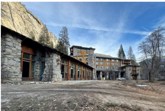
Completed repairs to the exterior of the Ahwahnee dining room.

The Ahwahnee Hotel in California's Yosemite National Park is a historic, 1920s-era hotel known for its beautiful architecture and stunning views of Yosemite's most recognizable cliffs and waterfalls. This project completed seismic retrofits to the hotel to comply with current seismic safety standards, which included installing structural bracing, lateral load resisting components in the floor, and shear walls in the dining room and kitchen. The project also replaced the kitchen floor structure, which was failing and critical to concession operations.