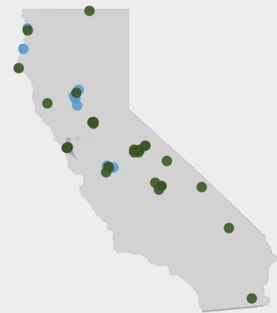
● GAOA LRF Projects ● Completed Maintenance Action Team Activities

As of December 2025, Maintenance Action Teams have completed work at 7 FWS locations and 1 NPS location in California.