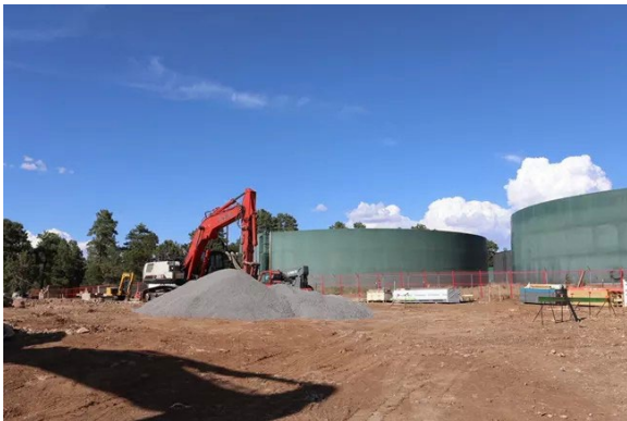
South Rim Wastewater Plant.

Grand Canyon National Park, considered one of the Natural Wonders of the World, is an immense, 277-mile-long canyon bisected by the Colorado River. The 1970s-era South Rim Wastewater Treatment Plant equipment and processes are outdated, inefficient, and overloaded. This project will replace the South Rim Wastewater Treatment Plant with a new plant that is able to efficiently process peak season wastewater demands, minimizing emergency repairs and helping to ensure safety for visitors, staff, and residents. The project will also upgrade the new control building with modern code-compliant HVAC and electrical systems, fire alarms and fire suppression systems, and modern wastewater processing equipment.