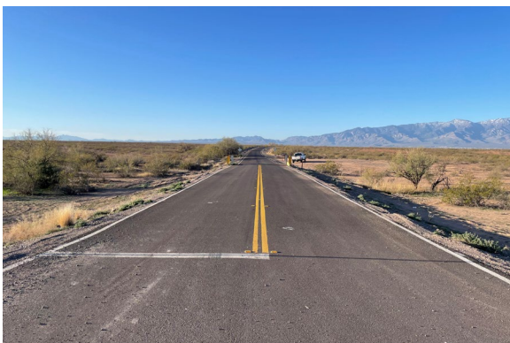
Newly paved section of Haekel Road.