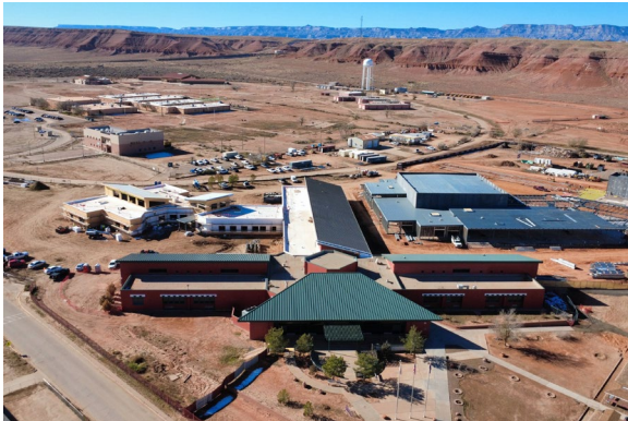
Aerial view of construction work at Many Farms High School campus.