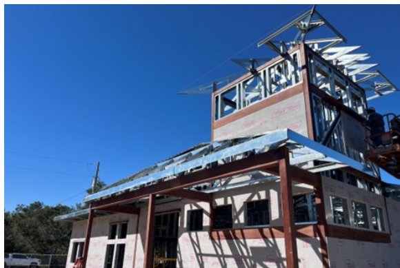
Replacement headquarters building in construction.