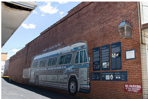
Greyhound Bus Depot and Mural Building.

Freedom Riders National Monument, Birmingham Civil Rights National Monument