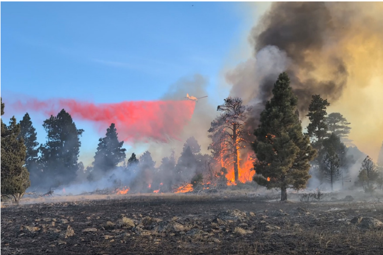
Aircraft drops retardant on the Vee Lake Fire in Oregon.