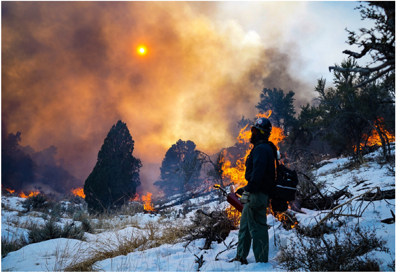
Prescribed burn in Nevada.