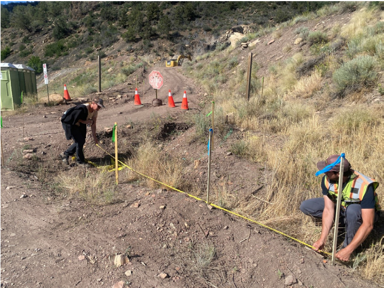
Field staff measure and mark the ground to lay out an inlet structure along an access road at a reclamation site.

The 2027 budget also includes $168.7 million, including $134.0 million for the Abandoned Mine Land Economic Revitalization (AMLER) program, to support coalfield communities.