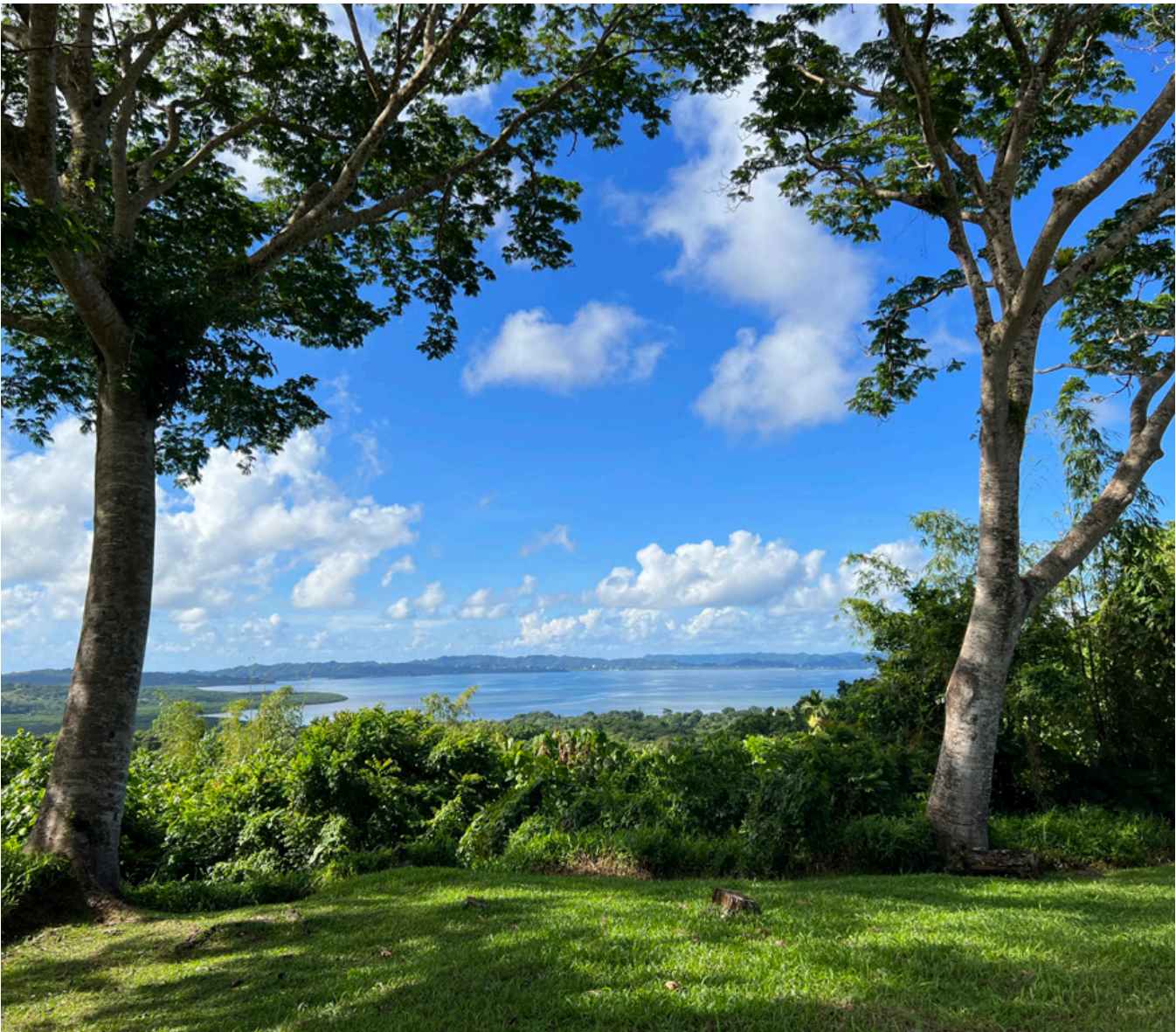
View of Koror from Aimeliik, Republic of Palau.