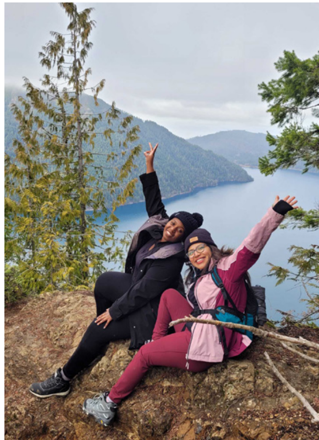
Mount Storm King viewpoint of Lake Crescent in Olympic National Park, WA.

education, and management programs ensure America’s natural, cultural, and recreational treasures are understood by and available to all Americans. To help showcase and care for these treasures, NPS values the help of a strong volunteer force, organized through partnerships, to support visitor services. This budget request also supports