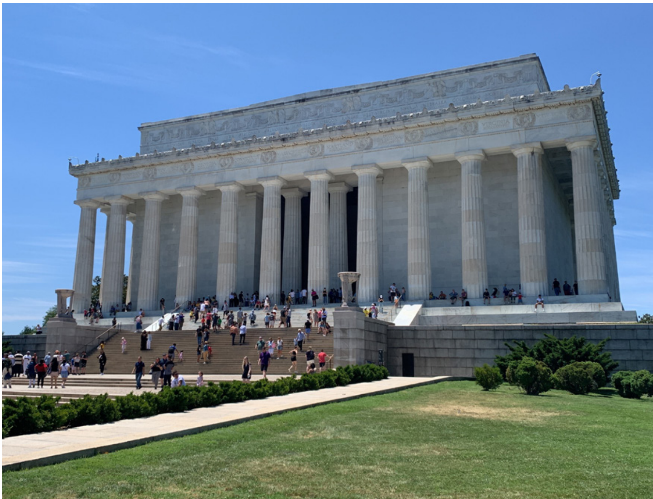
Lincoln Memorial in Washington, DC.

As the capital of the greatest country in the history of the world, Washington, DC should showcase beautiful, clean, and safe public spaces. However, many historic park features and public-facing infrastructure throughout the city show signs of decay after years of heavy public use and