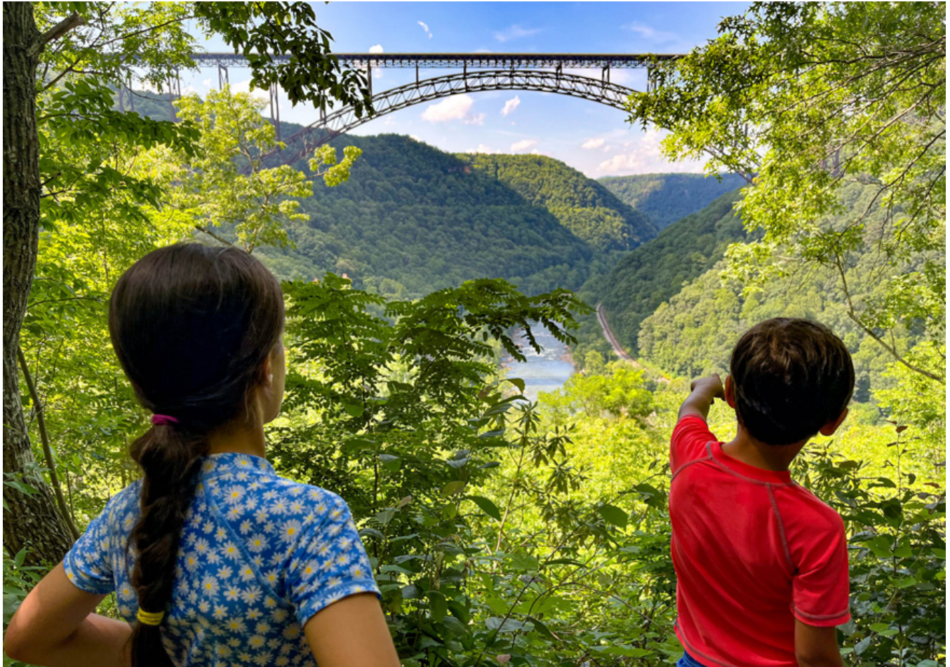
Long Point near Wolf Creek Falls in New River Gorge National Park and Preserve, WV.