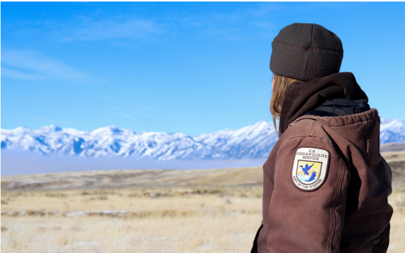
FWS biologist looks towards mountains in the background at the National Elk Refuge, WY.

Although FWS is responsible for conserving natural resources across broad landscapes, its work to conserve natural resources is aided by partnerships with States, Tribes, and private landowners. These intergovernmental funding efforts will be complemented by FWS investments in partnerships with private landowners. FWS works