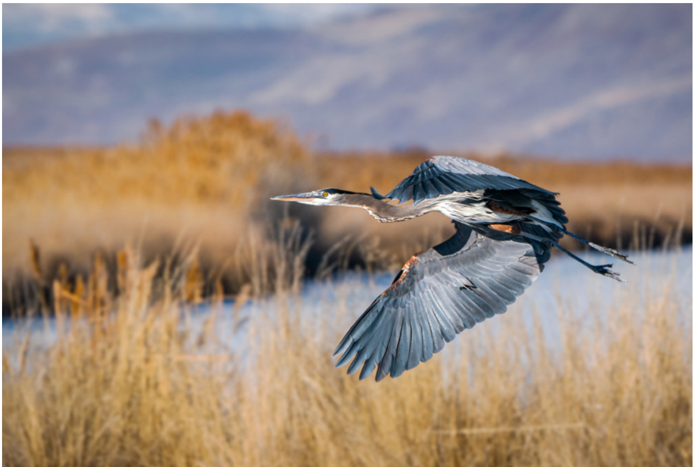
Blue heron flying over Great Salt Lake in Utah.

The 2027 budget request is $1.0 billion and supports eight FTEs. Interior will use its significant water management, mapping and science, invasive species management, and land management expertise and capacity to carry out activities that support the Great Salt Lake watershed and ecosystems. The GSLWRP will transfer funding to bureaus across the Department, including the U.S. Fish and Wildlife Service, U.S. Geological Survey, Bureau of Land Management, and Bureau of Reclamation and transfer funds to cooperating Federal agencies. Interior will collaborate with Federal and State-level stakeholders to ensure effective distribution of funds and measurable improvements to water flows into and within Great Salt Lake.