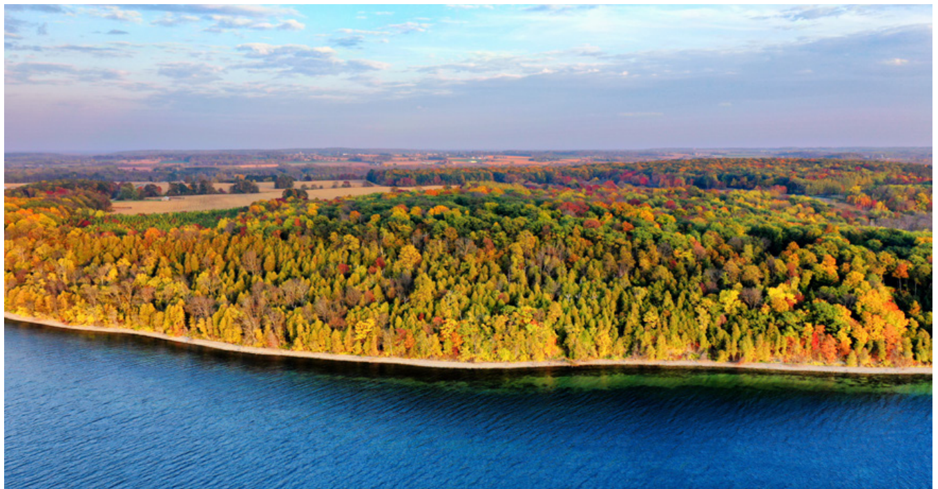
Door County Land Trust (DCLT) acquired the 119-acre Oak Bluff Natural Area along the Green Bay shoreline with the supporting match of Knowles Nelson Stewardship Grant, Great Lakes Restoration Initiative-Joint Venture, and DCLT private funds, WI.

The 2027 budget request for NRDAR is $4.7 million. The Department of the Interior NRDAR Fund supports natural resource damage assessment, restoration planning, and implementation at hundreds of sites nationwide in partnership with Federal, State, and Tribal cotrustees. In 2027, NRDAR anticipates $654 million will flow into the fund from gross receipts recovered through settled damage assessment cases, advanced cooperative assessment funds, and earned interest. By statute, those receipts can be used by trustees only to restore injured lands and resources or to reimburse for past assessment costs. Directly appropriated funding in