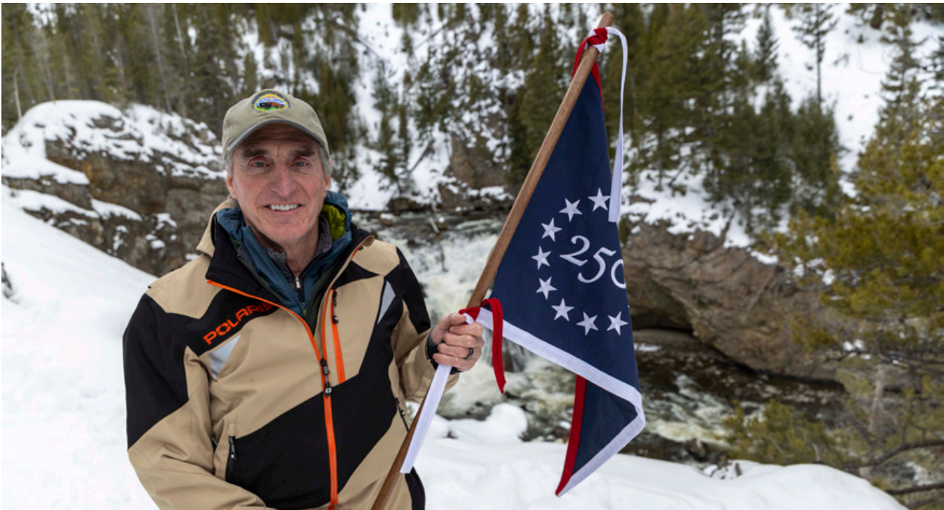
Secretary Burgum visiting Yellowstone National Park.