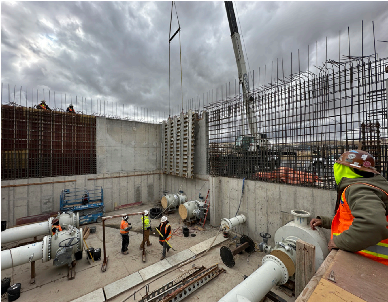
Construction of the Santaquin South Turnout progresses on the Spanish Fork–Santaquin Pipeline, Utah Lake System.

account funding will also support operation and maintenance of the recently constructed Provo River Delta Restoration Project, providing enhanced fish and wildlife habitat and recreational opportunities for nearby urban populations.