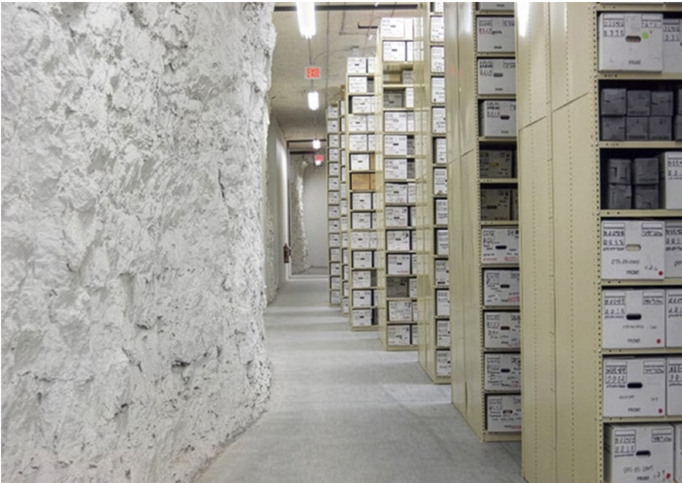
Files in the American Indian Records Repository.

Fixed costs of $101,000 are fully funded.