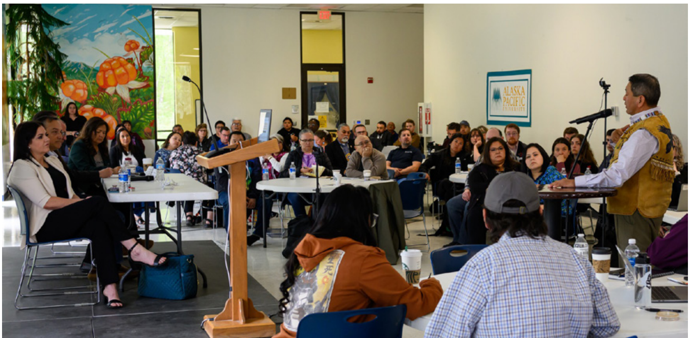
Leadership from Indian Affairs met with Tribes to improve efficiency.