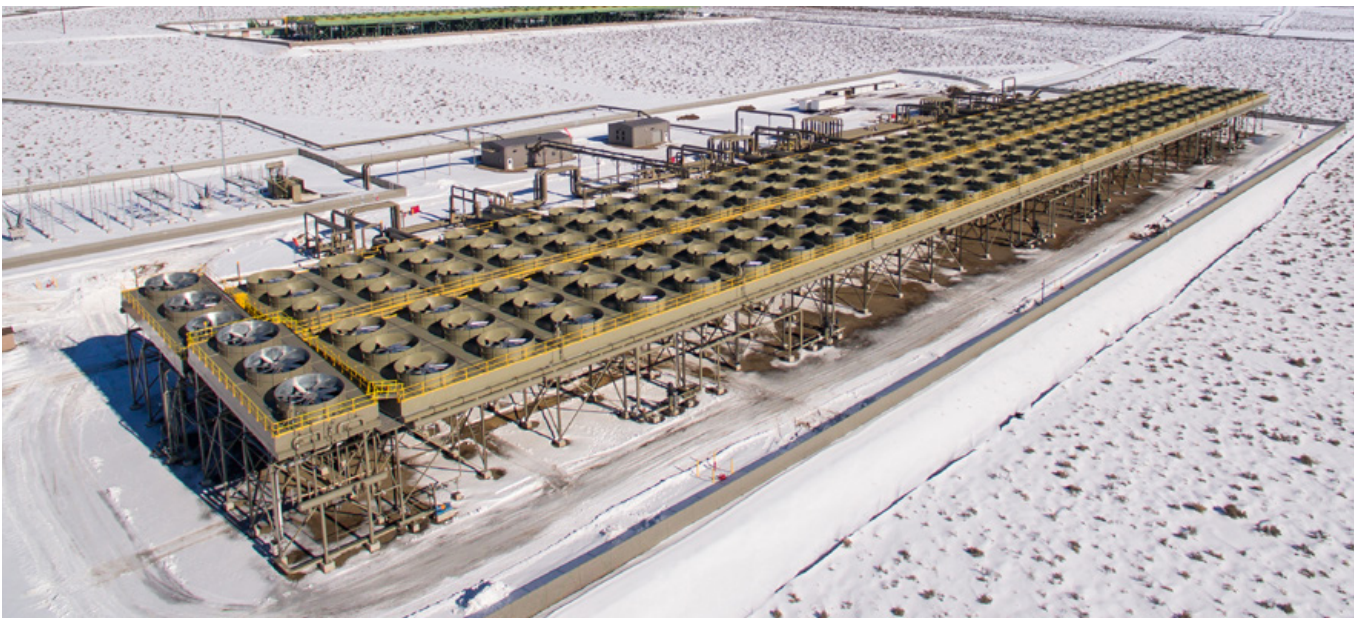
A geothermal site in Nevada.

Fixed costs of $695,000 are fully funded.