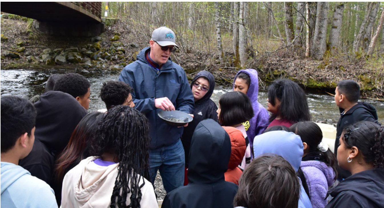
BLM geologist explains the process of gold panning and the properties of gold that make it possible at the Campbell Creek Science Center in Alaska.

12.5 percent, reversing the 16.67 percent rate set by the Inflation Reduction Act (Public Law 117–169). Lowering the Federal onshore royalty rate reduces the cost of doing business on public lands, making oil and gas development more economically attractive to industry. Already, lease sales are setting records, with a recent BLM Utah lease sale resulting in $10 million more than the last record-setting sale in the State. Such circumstances will spur additional leasing and drilling activity, which, in turn, supports increased domestic energy production and reduces reliance on foreign oil. BLM lease sales are supporting American Energy Dominance by