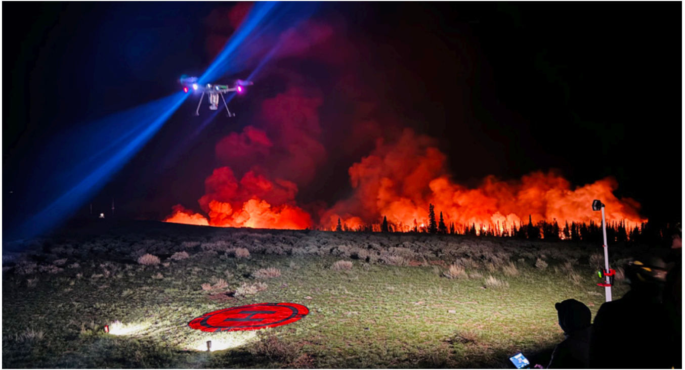
Night aerial ignition operations on the Burdick RX in the High Desert District in Wyoming.