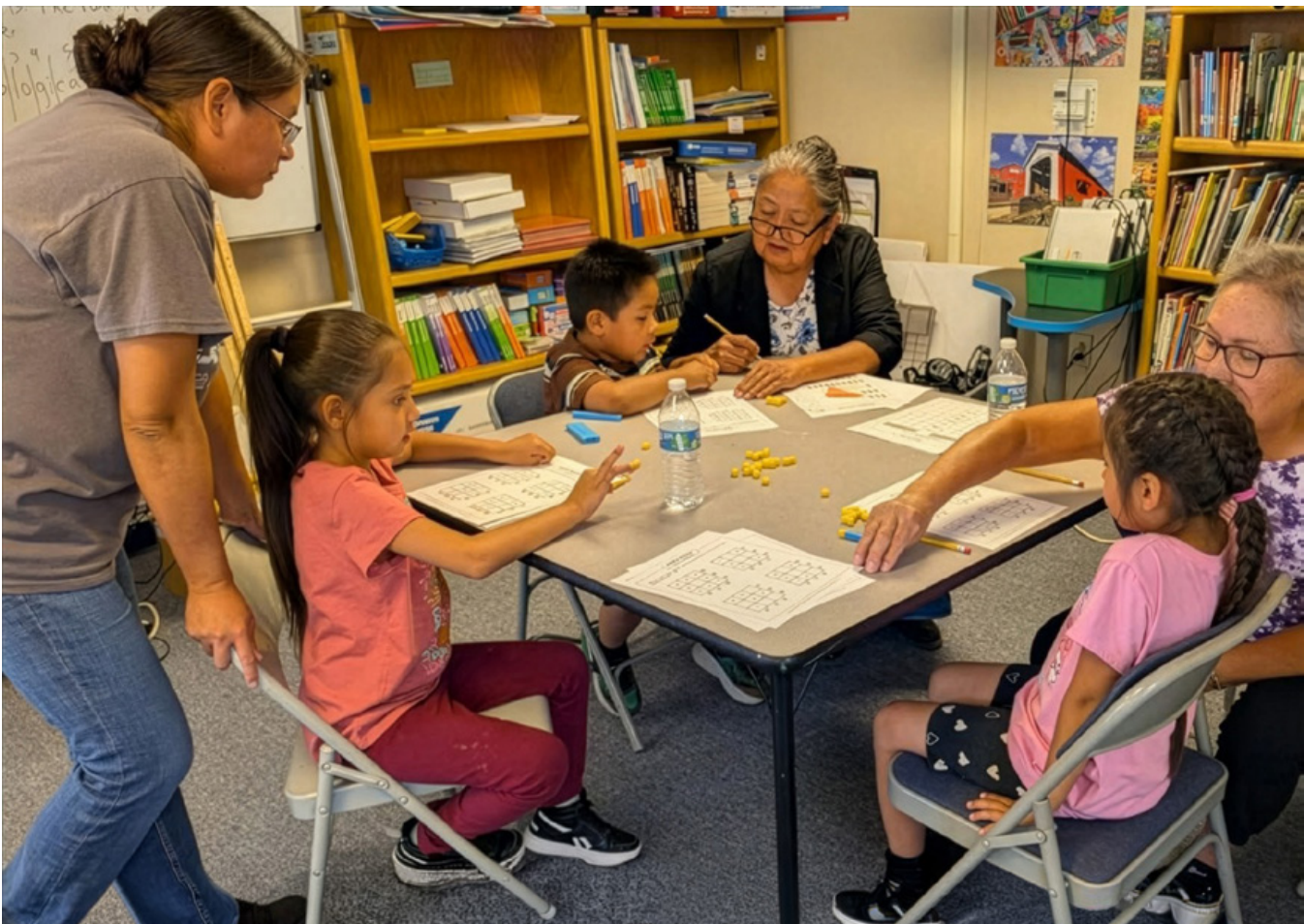
Family Math Night for Pre-K through 6th grade students and their families at Cove Day School in Cove, AZ.

Fixed costs of $13.2 million are fully funded.