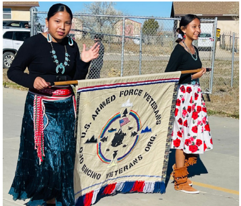
Veterans Day Parade at Ojo Encino Day School in Cuba, NM.