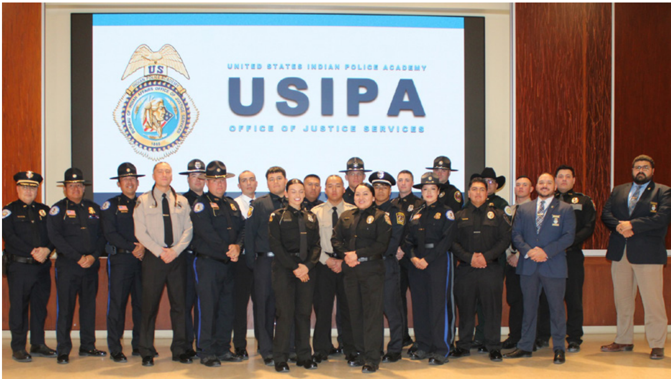
Indian Country Police Officer Training Program graduation.