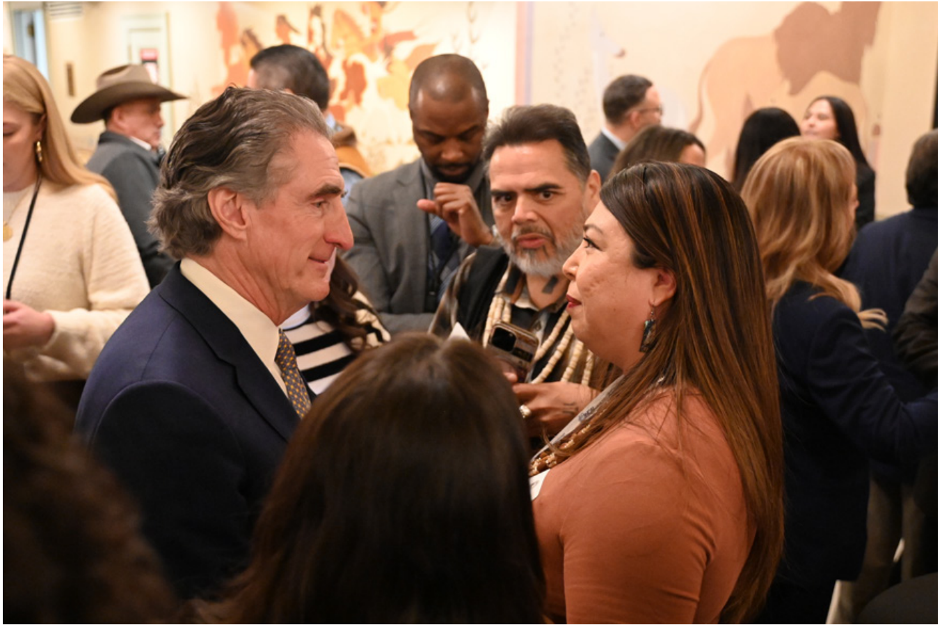
Secretary Burgum meets with Tribal leaders in February 2026.