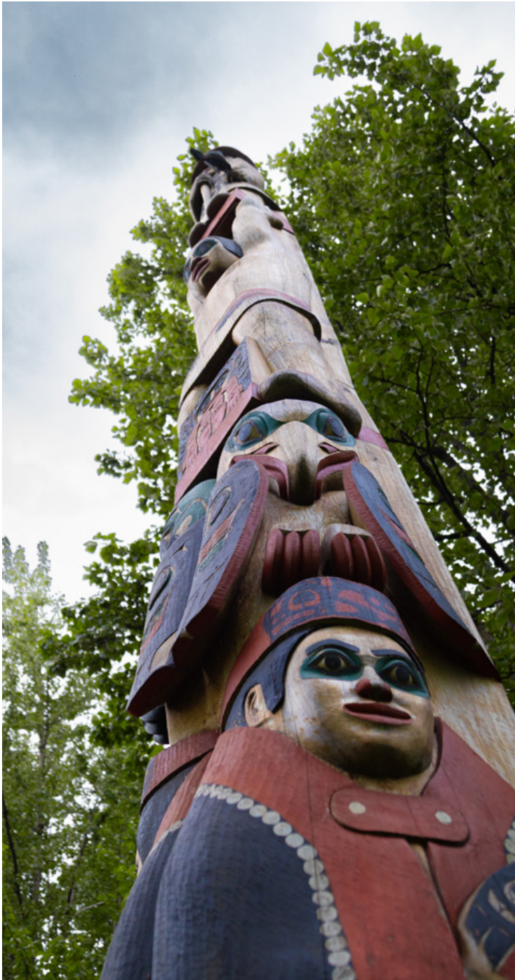
Totem pole at the Alaska Native Heritage Center in Anchorage.