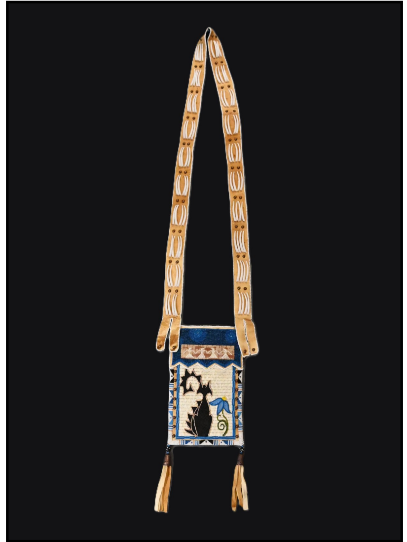
Wabish Keego, Bandolier Bag Quill, Beads, Buckskin, and Shell ©2024 Beth Bush SPIM Collection