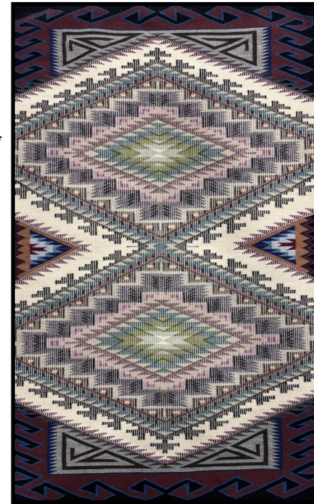
Raised Outline Navajo Rug Hand Dyed and Woven Wool ©2024 Florence Many Goats SPIM Collection