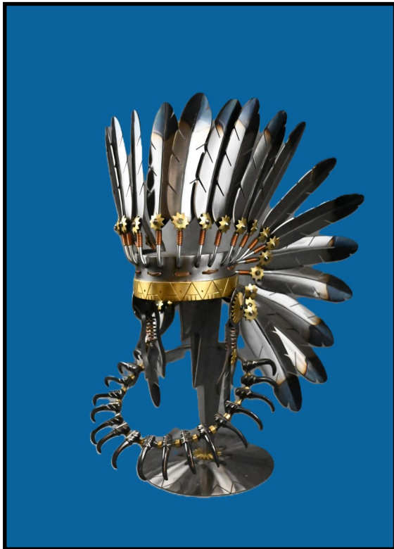
Headdress of the Plains Forged and Hand Sculpted Metal