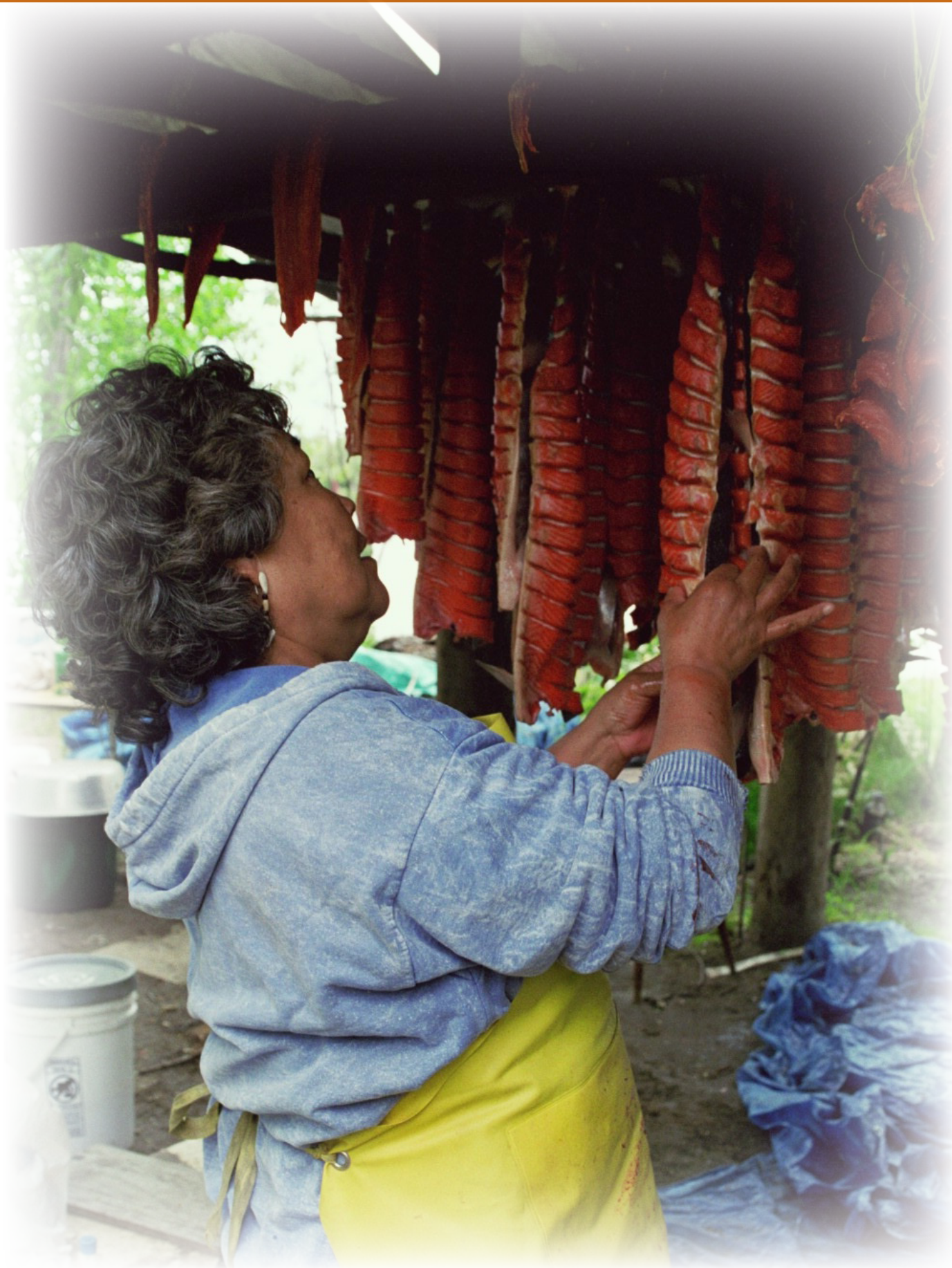
At Lekander fish camp on the Kuskokwim River