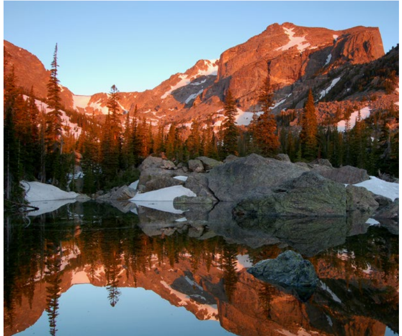
Hallett's Peak reflected in Lake Haiyaha in Rocky Mountain National Park.

The National Park System covers 85 million acres and comprises 433 sites, including 139 historical parks or sites, 87 national monuments, 63 national parks, 31 national memorials, 25 battlefields or military parks, and 88 otherwise designated national park units. NPS also helps administer the