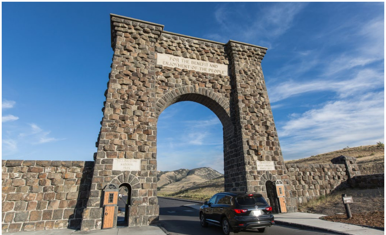
Roosevelt Arch at the North Entrance to Yellowstone National Park.