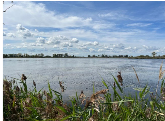
Pearson property which is owned by the Ohio Department of Natural Resources.

The fourth property acquired was incorporated into the Ottawa National Wildlife Refuge. Settlement funds were leveraged for management of invasive plants, restoration of agricultural fields to native ground cover, forbs, and trees, wetland enhancement, and hydrological modification in partnership with the Great Lakes Restoration Initiative. These properties are now accessible to the public for recreational use.