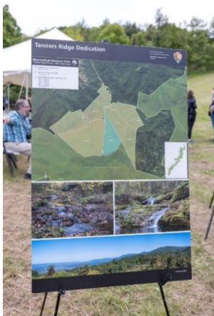
Tanners Ridge Dedication in May 2023.

The official Tanners Ridge Dedication Ceremony was held on May 18, 2023, and was hosted by the Shenandoah National Park (SNP) and the SNPT. The event celebrated the SNPT’s donation of 969 acres to the Park to be protected in perpetuity. The acquired parcels (from 3 different landowners) contain relatively undisturbed forested habitat for migratory birds, bats, and other wildlife, as well as headwaters streams that support brook trout. Because the parcels are adjacent to SNP, this acquisition and donation increases the amount of contiguous protected habitat for migratory birds, bats (including Indiana Bat and Northern Long-Eared Bat), and other wildlife. To date, this is the largest (acreage) acquisition funded by the DuPont NRDAR settlement.