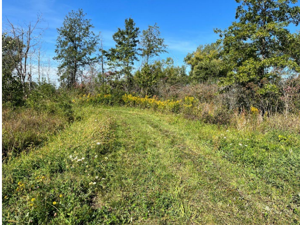
Hageman Unit that is now owned and maintained by Ottawa National Wildlife Refuge.

The hazardous substances migrated from landfills along the banks of the Ottawa River and industrial facilities in the watershed, contaminating water, fish, and wildlife in the Ottawa River. These landfills have been remediated under CERCLA, RCRA and CWA authorities by the US Environmental Protection Agency (EPA) and Ohio Environmental Protection Agency (Ohio EPA).