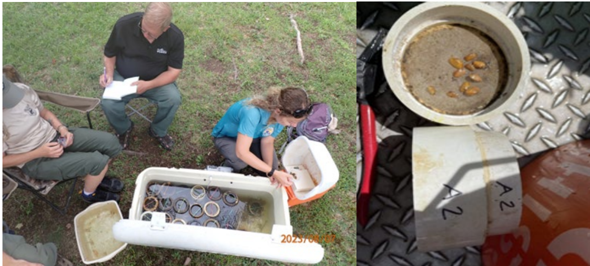
(right) Field biologists investigating juvenile mussel growth and weight in the Kanawha River, WV.

Damage assessment cases are conducted by one or more of the resource management bureaus within the Department: Fish and Wildlife Service, National Park Service, Bureau of Land Management, Bureau of Indian Affairs, and Bureau of Reclamation. Support for economic analysis is provided by the Office of Policy Analysis; scientific and technical analysis and support is provided by the U.S. Geological Survey; and the Office of the Solicitor provides legal counsel. In nearly all cases, the Department's assessment activities are carried out in partnership with other Federal, State, and/or Tribal co-trustees. These partnerships have proven advantageous, as cooperation, consultation, and collaboration amongst the trustees facilitates addressing multiple resource management concerns across different levels of governments and consolidates those concerns into a single case. Trustees can also share data, achieve economies of scale, avoid duplication of effort and minimize administrative burdens and expenses. Responsible parties also benefit, as they are able to address all trustee concerns in a single, unified case.