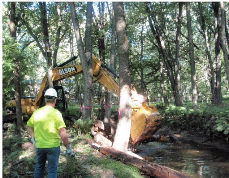
Installation of woody habitat in Lancaster Brook. Pictured - Staff from Oneida Nation overseeing the project.

The Fox River/Green Bay Trustees helped support the acquisition and protection of a 17-acre parcel within the Oneida Reservation. Protecting this parcel is significant as it contains a 1,950 foot reach of Lancaster Brook, a Class II brook trout stream, along with approximately 7 acres of adjacent wetland habitat. Protection of this important area also facilitates the ability to enhance habitat to a preferred state through restoration projects. As a result, fish passage impediments have been addressed and woody habitat has been added to the stream - adding log structures to this reach of stream creates feeding habitat and refugia for brook trout.