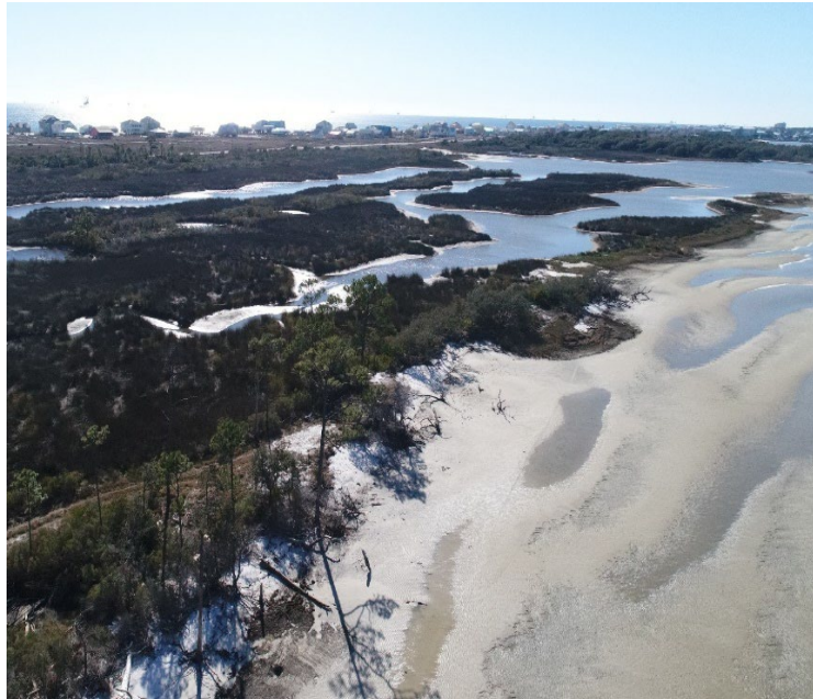
The former Pilot Town property on Fort Morgan Peninsula was acquired and preserved in perpetuity.

Approximately 73.43 acres acquired on Fort Morgan Peninsula in Alabama were incorporated into Bon Secour National Wildlife Refuge in July 2023. This land acquisition was part of the Regionwide Trustee Implementation Group's September 2021 Restoration Plan 1. This successful acquisition was the result of DWH NRDA settlement funds and collaborative efforts between the FWS, Alabama Department of Conservation and Natural Resources, The Nature Conservancy, and the local community's active engagement to preserve the land.