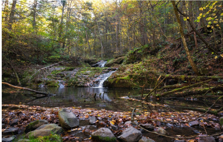
Photo of land on Tanners Ridge acquired by the Shenandoah National Park Trust. Of note, there were several large, healthy hemlocks near the creek (Naked Creek), and a waterfall.

In 2023, the Shenandoah National Park Trust (SNPT) acquired 969 acres of rolling woodlands in Page County, VA that had been under threat of development for many years. The acquisition of these acres by the SNPT was made possible through DuPont Waynesboro Natural Resource Damage Assessment and Restoration (NRDAR) settlement funds and the collaboration of many partners and landowners including the SNPT, Potomac Appalachian Trail Club, Valley Conservation Council, the Commonwealth of Virginia, the US Fish and Wildlife Service, and the supportive landowners who rallied together in an effort to protect this large area of contiguous forest.